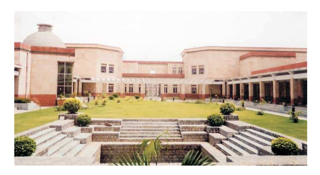
NATIONAL INSTITUTE OF LABOUR ECONOMICS RESEARCH AND DEVELOPMENT Sector A-7, Institutional Area, Narela, Delhi-110040 <a href="http://www.nilerd.ac.in/">http://www.nilerd.ac.in/</a>